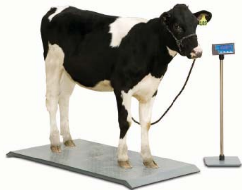
PS2000 shown with optional indicator stand