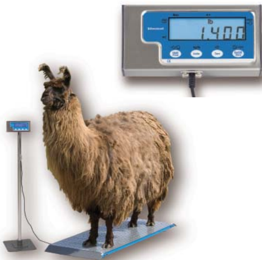
PS1000 shown with optional indicator stand